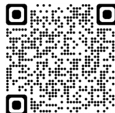
Afib Risk Calculator