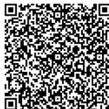
Why is Cardiac Rehab Important?