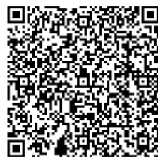
Benefits and Side Effects of Statins